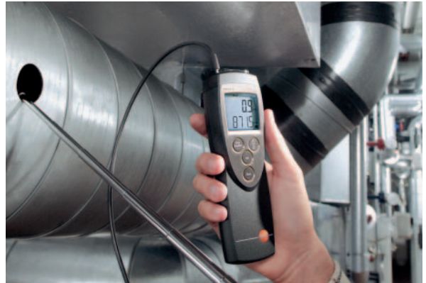
testo 425, e.g. for monitoring the volume flow of the exhaust air